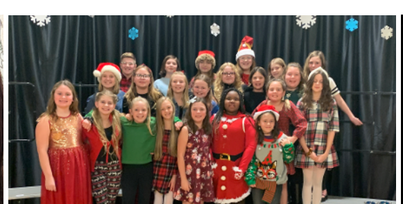
100% of the students at the elementary level have exposure to art, music, physical education, technology and library each week