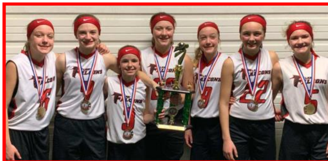
Youth Little Monsters also traveled to Indiana and won the Gym Rats March Invitational! Go Falcons!